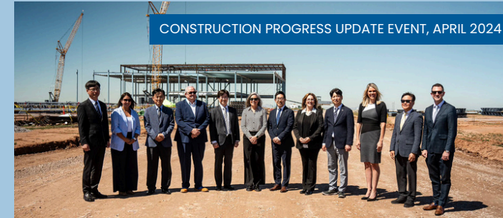
CONSTRUCTION PROGRESS UPDATE EVENT, APRIL 2024

LG ENERGY SOLUTION $3.2B CAPEX 2,800 JOBS > 1.3M + SF